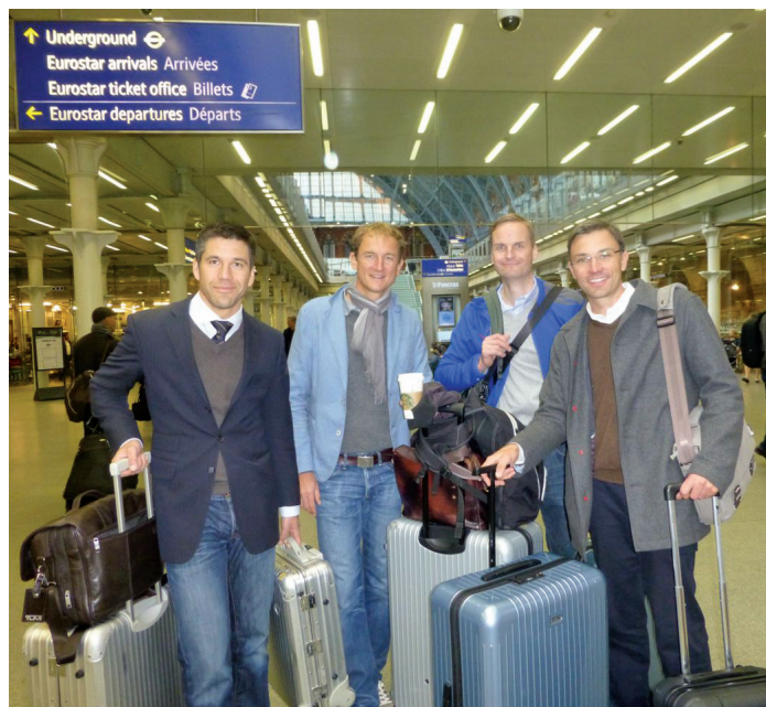
Fig. 2 "Always on the go, bags included". The four ASG traveling fellows on their way from London to Nottingham