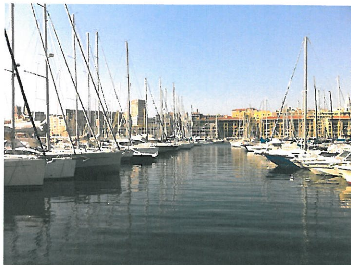
Marseille Vieux Port

Socially, we enjoyed the tasty french kitchen and wine in „Le Bistro 31“ and „l'Epuisette“ nearest to the sea.